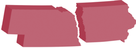
Western Iowa & Nebraska on Higher Education And Disability

WINAHEAD is made up of representatives from 30 institutions. Our members are